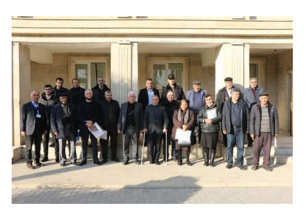
In April 2021, on the initiative and coordination of IEPF, the heads of civil society organizations consisting of current Public Council members launched an international petition regarding Armenia's refusal to submit mine maps. With the participation of well-known public figures,