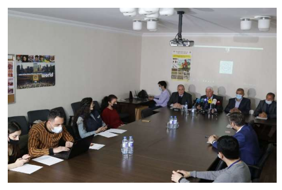
In October 2021, members of the Public Council, together with ANAMA's staff, participated in the installation of mine education billboards in Aghdam, Tartar, Goranboy, Fuzuli, Jabrayil regions and held educational conversations with local residents.