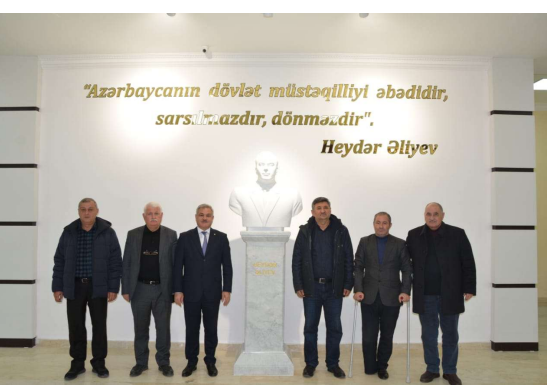
On December 5, 2021, the members of the council met with the participants of the project "Education on the danger of explosive ammunition" (EORE) held with the financial support of the European Union, the support of ANAMA and UNICEF Azerbaijan, and the International Eurasia Press Fund in the district of Barda, and watched the progress of the training. Proposals voiced by local residents on mine issues and UXO awareness were recorded as discussion topics.